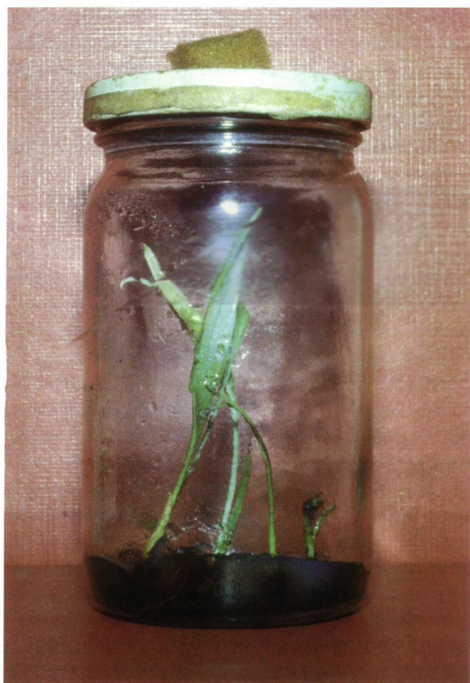
2. Chamaedorea seifrizii Burret plantlets under sterile conditions, at \approx 60 d of culture.

not germinate. The best results were obtained when dry seeds were scarified with sulphuric acid for 30 min, washed several times with sterile water, and then put in the culture medium (Fig. 1).