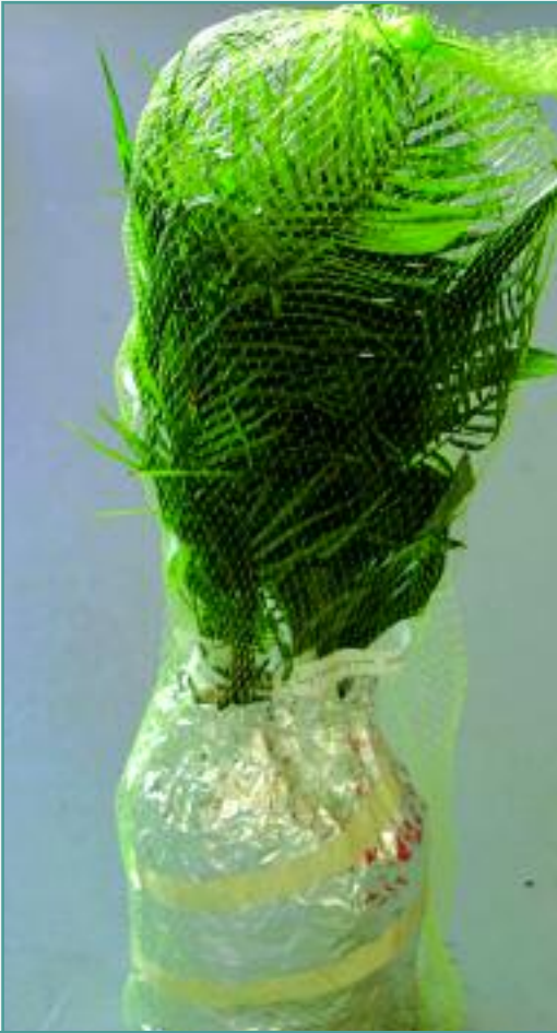
4. The palm is slipped into a net sleeve. The ends of the net sleeve are secured with knots.