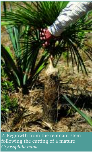
2. Regrowth from the remnant stem following the cutting of a mature Cryosophila nana .