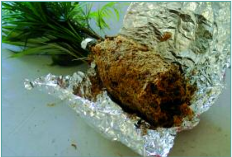
2. The rootball is wrapped in moist sphagnum moss and covered with heavy-weight aluminum foil.

The entire palm is sleeved in plastic netting (Figs. 4 & 5). Green netting is sold in tube form. The palm is inserted by the potted end. As the leaves are netted, they are carefully bundled. The netting is then cut to length and tied at both ends. Netting the palm protects the leaves and provides better “pack out.”