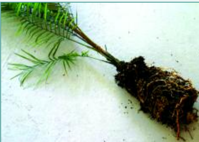
1. A seedling palm is unpotted.

Sphagnum moss harvested in Chile and New Zealand is purchased in compressed bales. The moss is hydrated by soaking for several hours in water mixed with SuperThrive™ growth stimulant. SuperThrive can be used at a stronger dosage than indicated in the label directions. Once the moss is loose and moist, it is wrung out like a washcloth. The moss is damp and ready for use. The rootball is blanketed with a layer of the damp sphagnum moss.