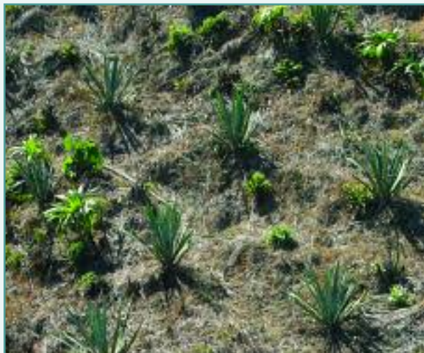
1. Within an Agave farm, remnants stumps of Cryosophila nana regenerate. They had previously been cleared to the ground by machete.

While some of this area is now protected from clearing, large amounts of the forest have been cut for housing and farming. A few of these farms grow Agave for the purpose of making tequila. Most of the large tequila farms are located many miles inland in high elevation volcanic valleys. However, several small-scale tequila farms have been carved out of the coastal forest to cater to bus tours that arrive from the major tourist hotels in nearby Puerto Vallarta.