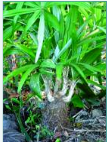
3. An unusual five-headed Cryosophila nana is the result of the palm's stem being cut.