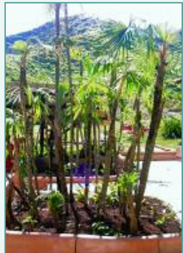
4. A bed of Cryosophila nana stems being rooted at The Botanical Gardens of Vallarta.