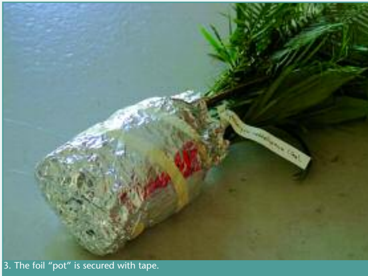
3. The foil “pot” is secured with tape.