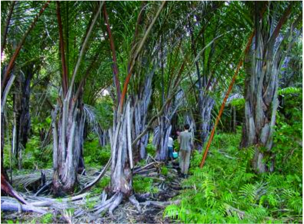
2 (above). A forest of Raphia australis with ferns carpeting the forest floor. 3 (below). A house constructed of petioles and rachises of Raphia australis .