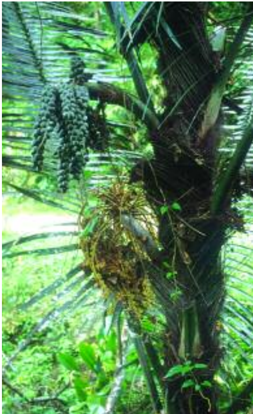
6 (left). Arenga westerhoutii with infructescence and staminate inflorescences past anthesis. 7 (right). Arenga obtusifolia with infructescences.

Arenga obtusifolia (Figs. 11, 13) has oblong-turbinate to ellipsoid fruits about 4.5 cm long