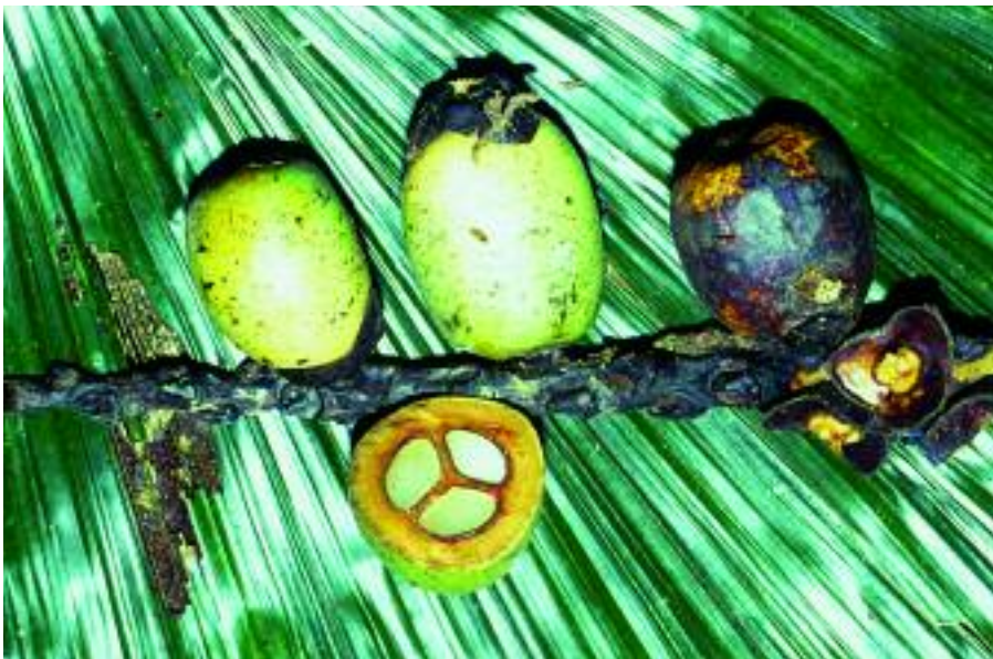
13 (bottom). Fruits of Arenga obtusifolia .