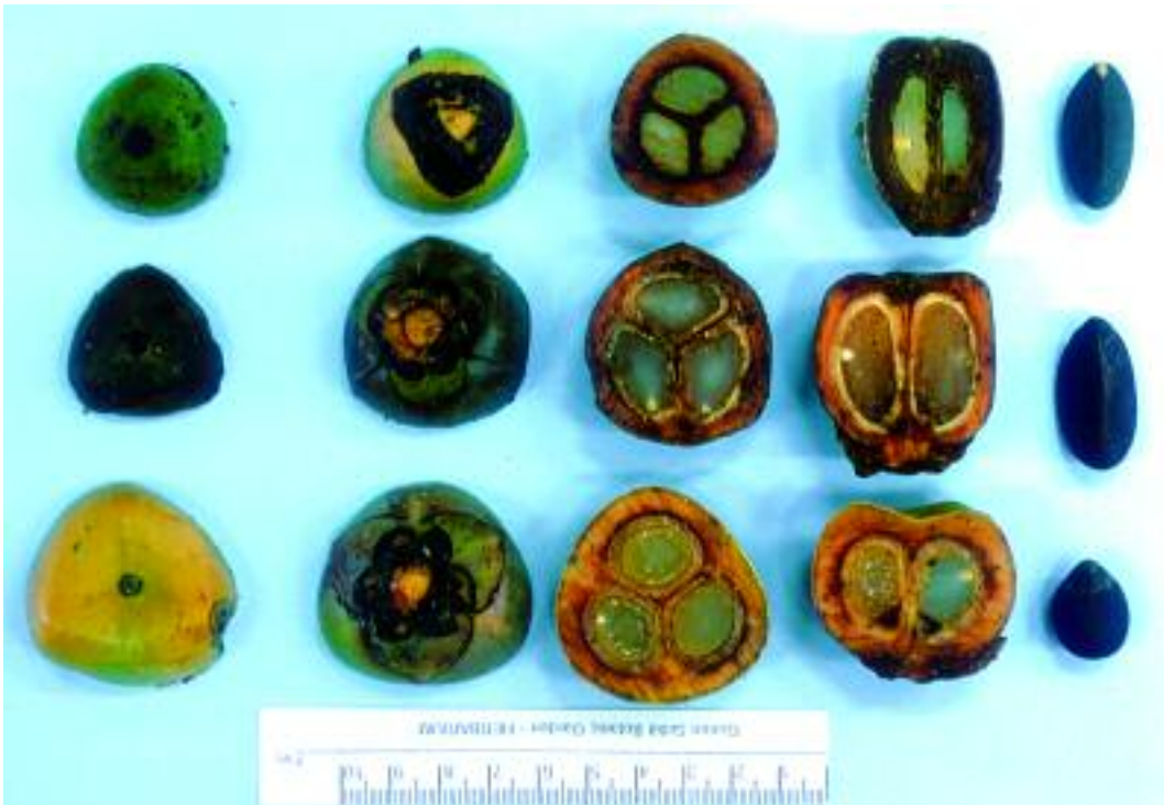
14. Comparison of dissected fruits. Row 1. A. obtusifolia . Row 2. A. westerhoutii . Row 3. A. pinnata . Column 1. Distal view. Column 2. Basal view. Column 3. Cross section. Column 4. Longitudinal section. Column 5. Seed.