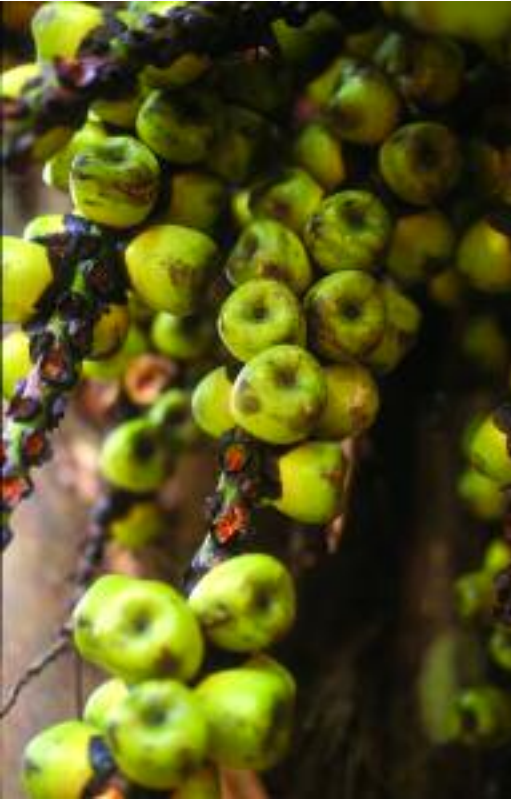
11. Infructescence of Arenga obtusifolia .

endosperms and cabbage for human consumption, leaves for thatch, leaf sheath fibers for blowgun darts and brooms (Miller 1964). Mogeia et al. (1991) claimed that A. pinnata is the most important sugar palm of the humid tropic and one of the most versatile multipurpose tree species in culture.