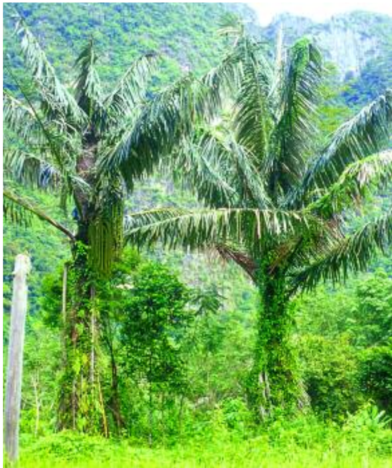
1. Arenga pinnata in Thailand.

Recent fieldwork in Thailand focusing on economic botany of sugar palms, which is here used as a collective term for the arborescent species of Arenga , (Fig.1) has revealed a number of useful fruit and seed morphological characters that we hope will help clarify species limits.