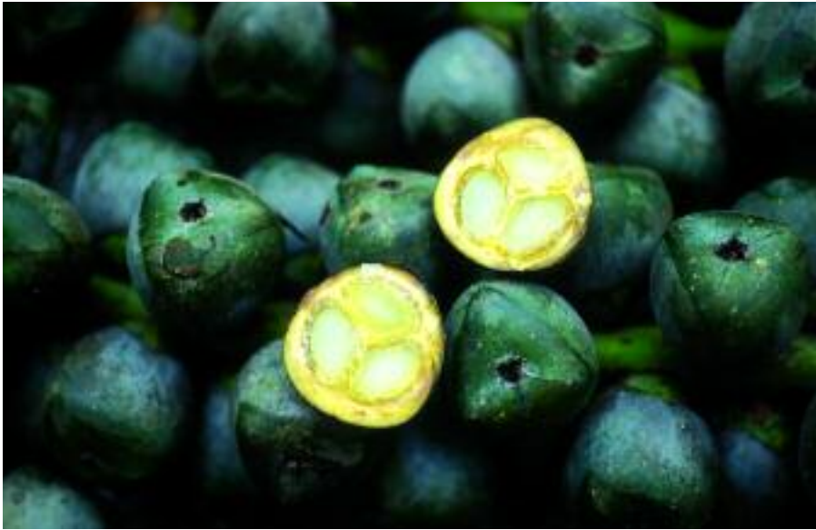
12 (top). Fruits and cross-section of Arenga westerhoutii .