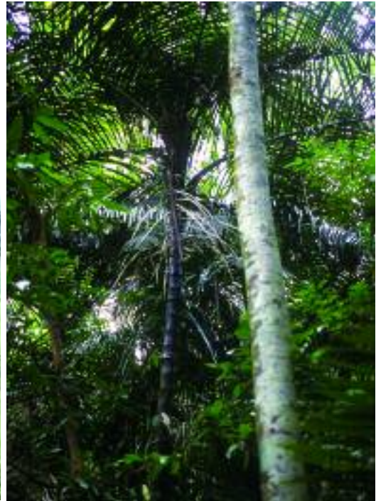
3 (left). Arenga westerhoutii in habitat. 4 (right). Arenga obtusifolia , in its natural habitat.

Pongsattayapipat et al. 26). In A. obtusifolia the leaflets are usually regularly arranged as well; however, they arise from the leaf rachis in several planes. The leaflets are silver-grey below. The auricles at the leaf base are not quite as unequal as is the case with the former two species (voucher: Barfod et al. 141643 and Pongsattayapipat et al. 25).