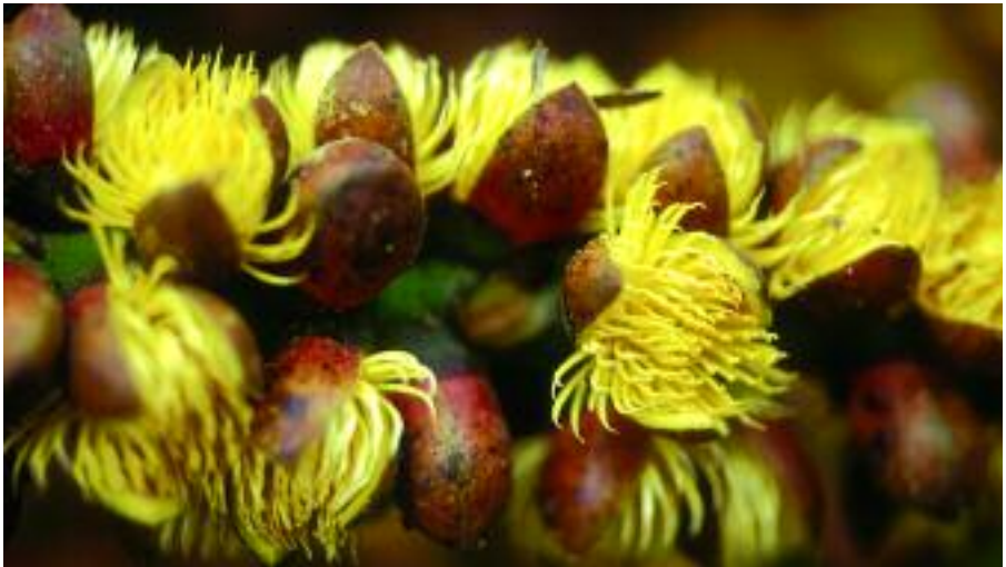
8. Staminate flowers of Arenga . Top: A. pinnata . Middle: A. westerhoutii . Bottom: A. obtusifolia .

and 3 cm wide. The apex is rounded and adorned with three lines that radiate along the middle of the carpels. The fruits are light green when mature to yellowish green at maturity.