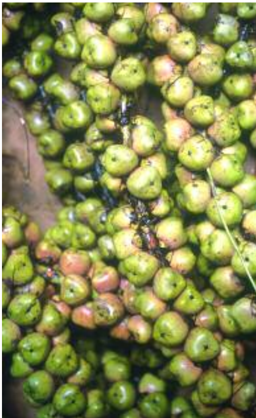
9 (left). Inflorescence of Arenga pinnata . 10 (right). Inflorescence of Arenga westerhoutii .

Arenga pinnata is an economically important resource that is exploited for multiple purposes. The most important use is tapping of sap from the inflorescence for sugar, wine or vinegar and extraction of starch from the stem for sago. Minor local uses include young